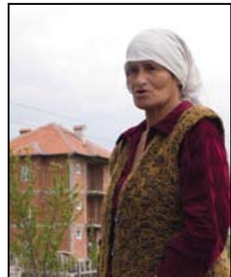
A woman in Kosova talks about her family living in poverty