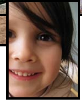
Left News and notes from around the world pg 12 Above P.A.C.E. programs lead to church planting movements pg 11