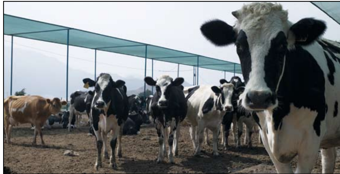
(Top) Snails and (right) cattle are two microfarm Kingdom Businesses incorporated into Project New Hope's overall objective. (Bottom) A barrio resident sits on top of a pile of adobes he made by mixing sand, water and dirt. The water and dirt had to be brought into the barrio by the local government since neither can be found locally.

To learn more about Project New Hope and their continuing work in Peru, visit their website at: www.projectnewhopeinternational.com